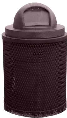
995-D31 32 Gal. Round w/Dome Lid