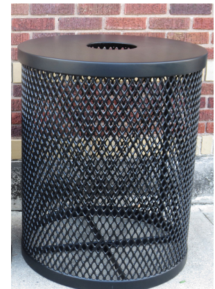
989-E31 55 Gal. Round 1-Piece w/8" Flat Lid