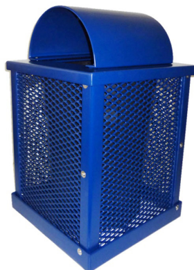
996-031 32 Gal. Square Arch Lid